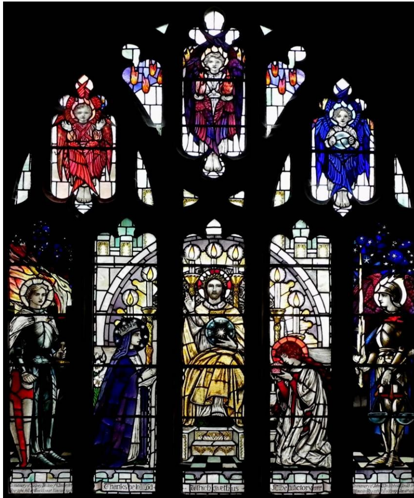
St Peter's Church, Hinton-on-the-Green

The magazine of the Churches of Hampton, with Sedgeberrow and Hinton-on-the-Green